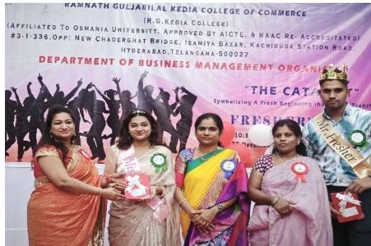
MBA Freshers Day Celebrations