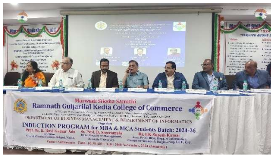
Induction Programme for MBA & MCA