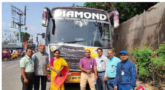
Industrial Visit to NRSC