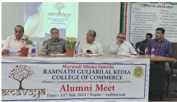
Alumni Meet: https://www.rgkediacollege.com/alumni