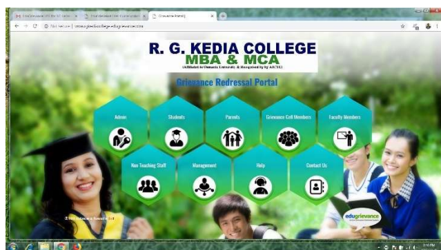
Online Grievance Portal