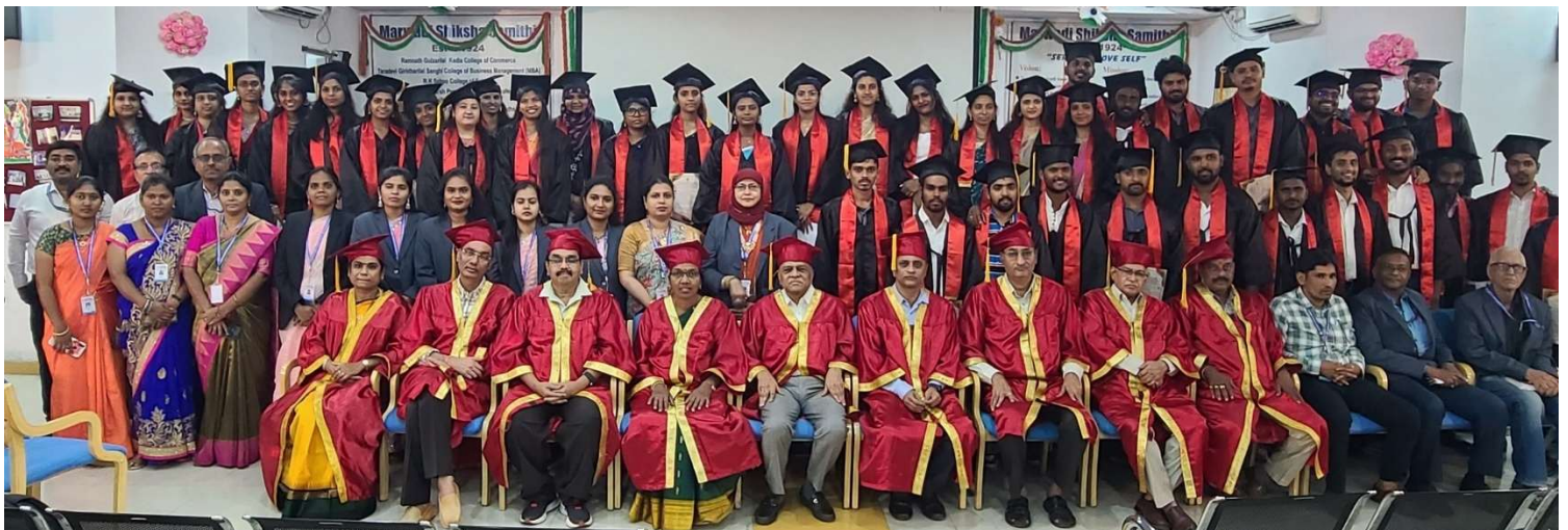
Batch 2022 - 2024