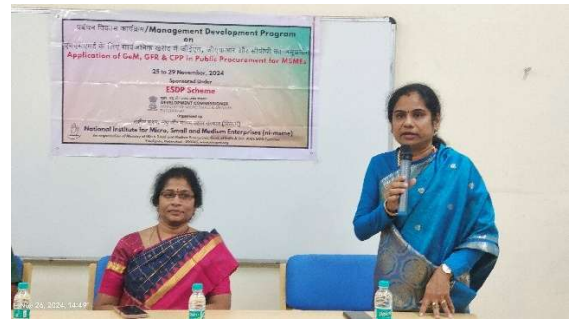
ESDP Scheme, NI- MSME