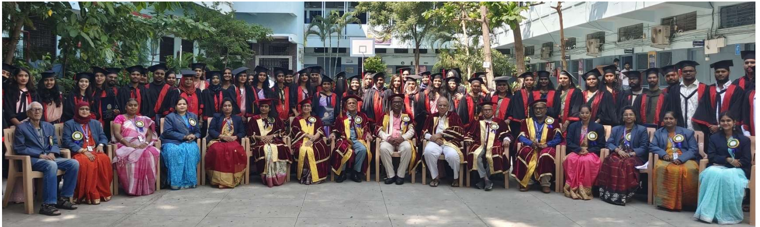
Batch 2022 - 2024