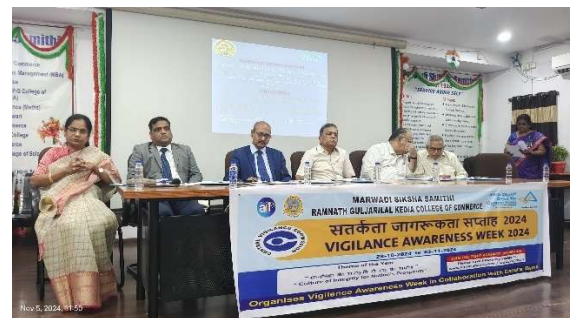
Vigilance Awareness Week