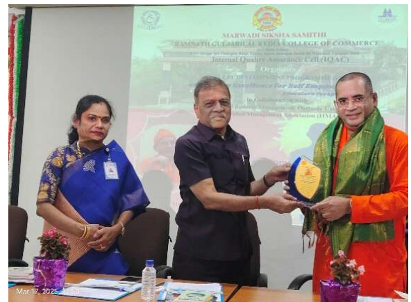
FDP on Excellence for Self-Empowerment