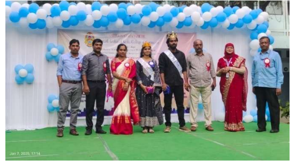
MCA Freshers Day Celebrations