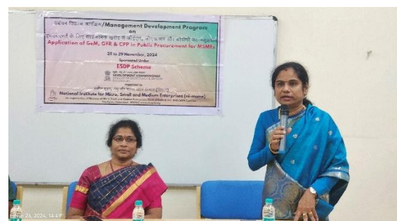
ESDP Scheme, NI- MSME