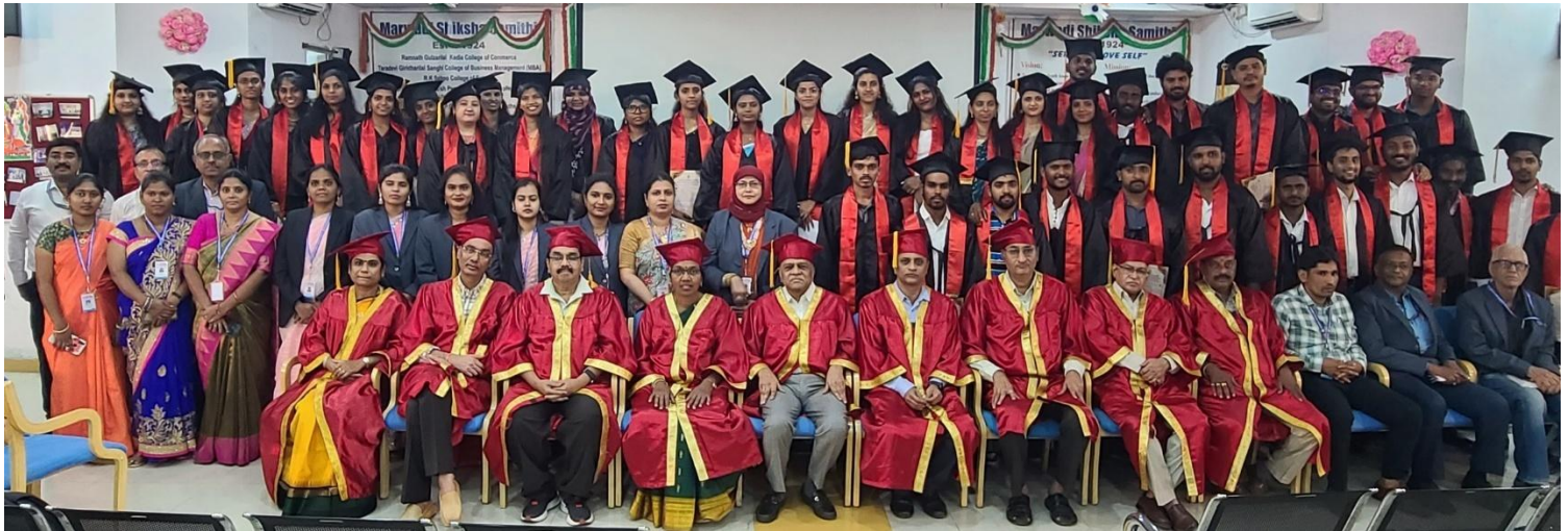
Batch 2022 - 2024