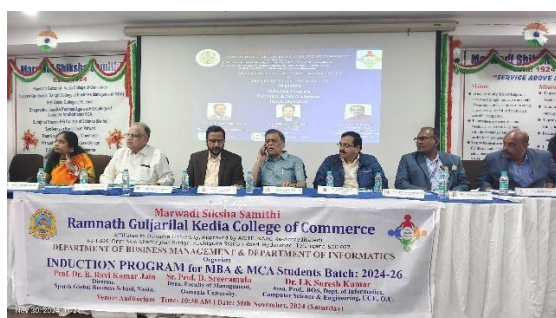
Induction Programme for MBA & MCA