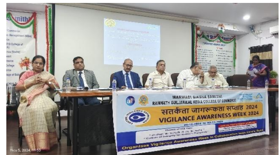
Vigilance Awareness Week