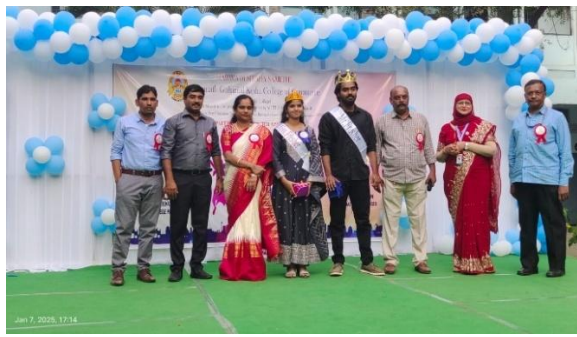
MCA Freshers Day Celebrations