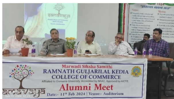
Alumni Meet: https://www.rgkediacollege.com/alumni