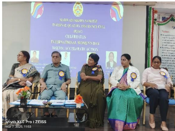
International Women's Day