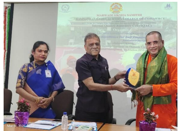
FDP on Excellence for Self-Empowerment