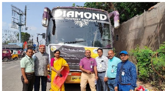
Industrial Visit to NRSC