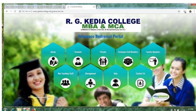
Online Grievance Portal